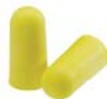
Part No. 312-1219