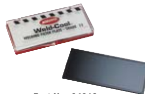
Part No. 84910