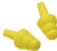
Part No. 340-4003