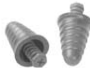
Part No. P1300