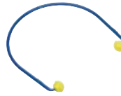
Part No. 321-2101