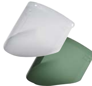
Part No. 82786 Part No. 82787