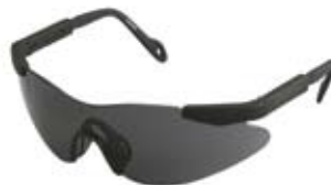
Part No. 11709