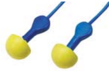
Part No. 311-1114