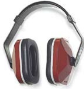
Part No. 330-3001