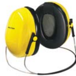
Part No. 0H9B