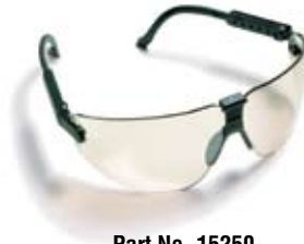
Part No. 15250