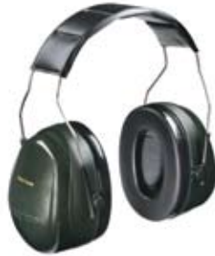
Part No. 0H7A