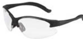
Part No. 11680