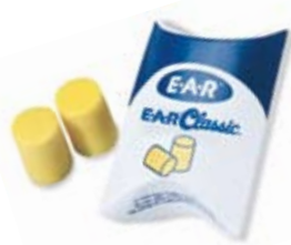
Part No. 310-1001