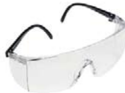
Part No. 15902