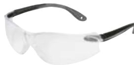
Part No. 11670