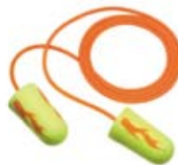
Part No. 311-1252