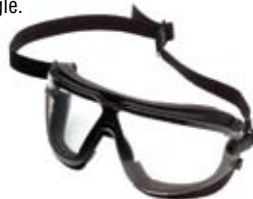
Part No. 16617