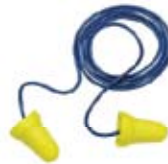
Part No. 312-1222