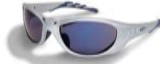
Part No. 11652