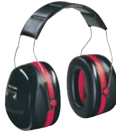
Part No. H10A