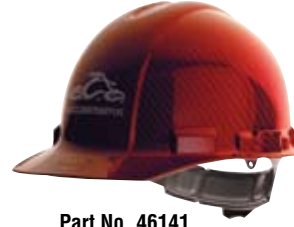
Part No. 46141