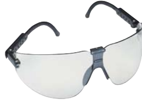
Part No. 15214