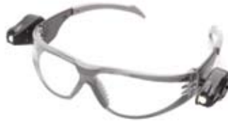
Part No. 11356