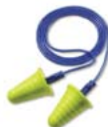
Part No. 318-1009