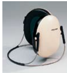
Part No. H6B/V