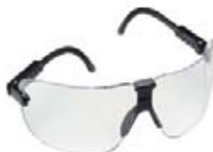
Part No. 16100