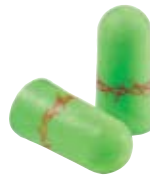
Part No. P1100