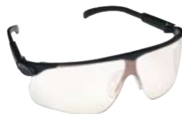
Part No. 12289