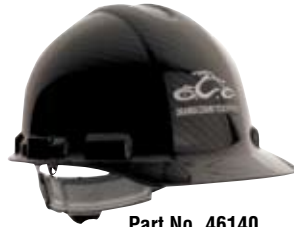
Part No. 46140