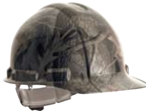
Part No. RT HH149