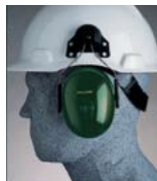
Part No. H7P3E