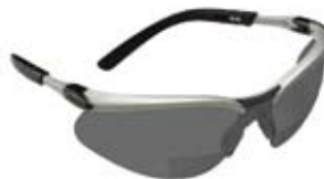
Part No. 11377