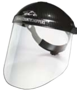
Part No. 82785