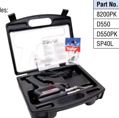
Part No. D550PK