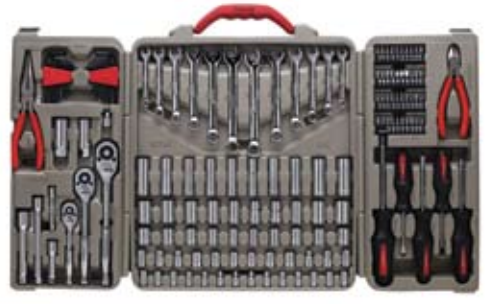
Part No. CTK148MP