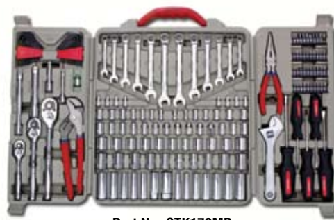
Part No. CTK170MP