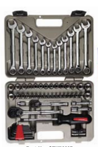
Part No. CTK70MP