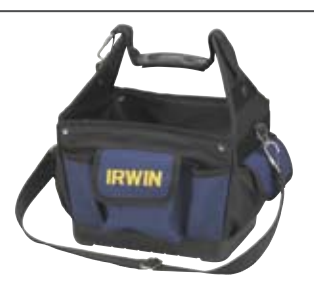
Part No. 420-004