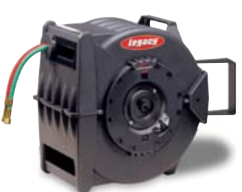
Part No. L8363