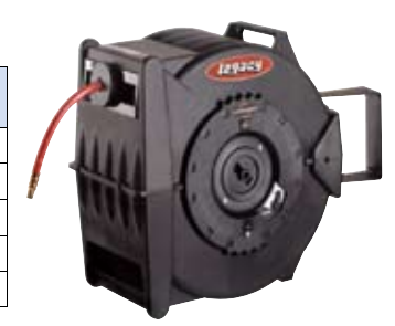
Part No. L8335

Model L8335 is ideal for high volume air tools. Also set-up for water applications.