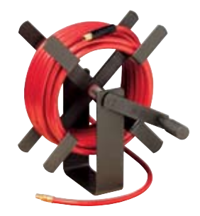
Part No. L8550