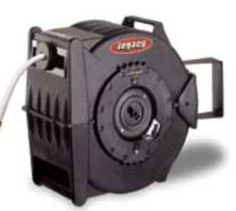
Part No. L8347