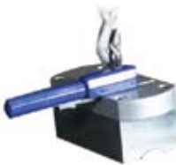
Part No. 8100127

Remarkably, this new technology lets you turn magnetic power on and off with a half turn of a handle! When incorporated into the ergonomic design of the Magswitch Medium-Duty Lifters and Heavy-Duty Lifters, you can pick up and move incredibly heavy, cumbersome objects with ease.