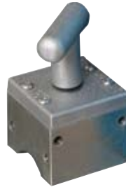
Part No. 8100054