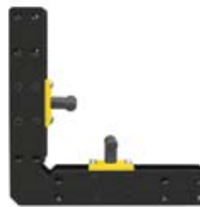
Part No. 8100036