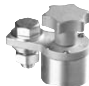
Part No. 8100315