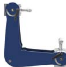
Part No. 8100090