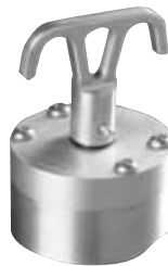
Part No. 8100006