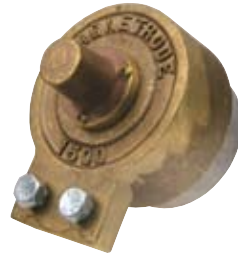
Part No. 1500

Model 2000 -(1500 AMPS) with terminal handle for attaching three 4/0 cables.