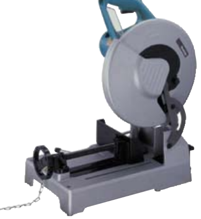
Part No. 2414NB