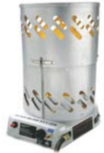
Part No. F170480

Heats approx. 4700 sq. ft. Run Time: 29 hrs. on 100 lb. cylinder (low)