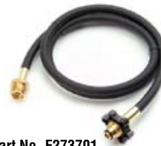
Part No. F273701