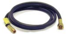
Part No. F273707