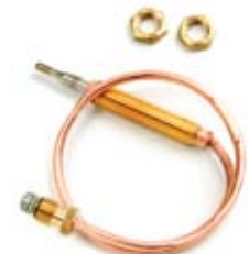
Part No. F273117