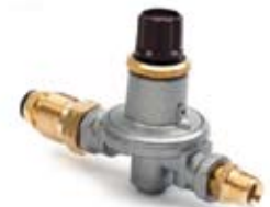
Part No. F273719