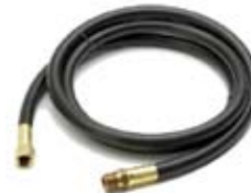
Part No. F273717