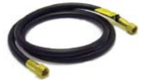
Part No. F276148