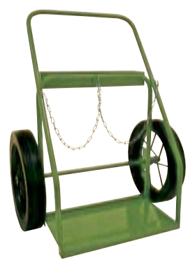
Part No. CTR-520-1T