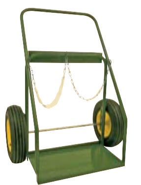
Part No. CTR-516-5T