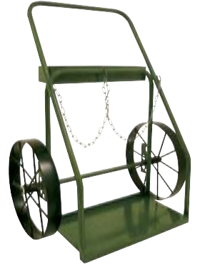
Part No. CTS-520-1T