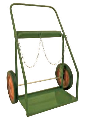
Part No. CTR-14

Large Cylinder Trucks The 500 series is a workhorse for larger cylinders. The 600 series is 4" wider to accommodate a 100# propane cylinder.