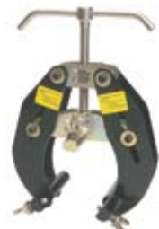
Part No. 781170