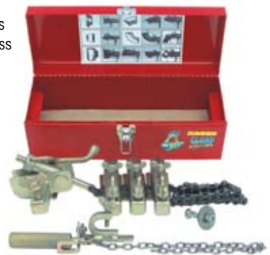
Part No. 781000