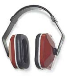
Part No. 330-3001