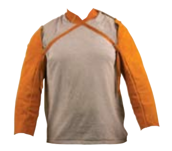
Part No. 910-12

Part No. 910-12L Part No. 910-12R Part No. 910-12