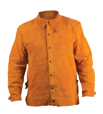
Part No. 910-1

Rolled collar with inside chest pocket. Non-reflective snap closure and snaps on wrist. Full length sleeves. Part No. 910-1: S, M, L, XL, XXL, XXXL, XXXXL Part No. BT910-1: S, M, L, XL, XXL, XXXL, XXXXL (Buck tan)