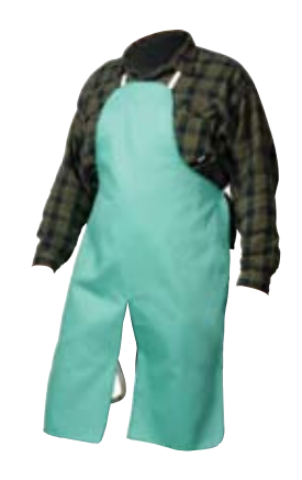
Part No. 940-26