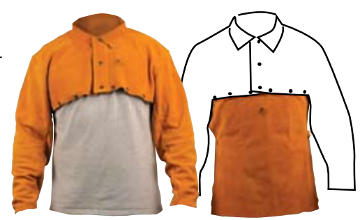
Part No. 910-6

Part No. 910-7-20: 20" Bib for more protection