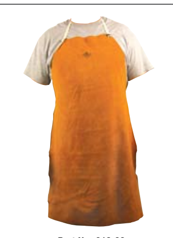
Part No. 910-22

Part No. 910-21: 24" x 24" waist apron Part No. 910-22: 24" x 36" bib apron Part No. 910-23: 24" x 48" bib apron Part No. 910-24: 24" x 48" split bib apron