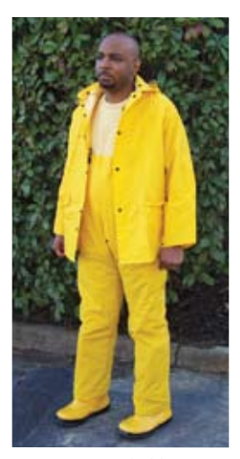
Part No. 3100 Part No. 3910