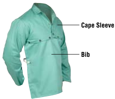
Part No. 940-6 cape sleeve Part No. 940-8 bib