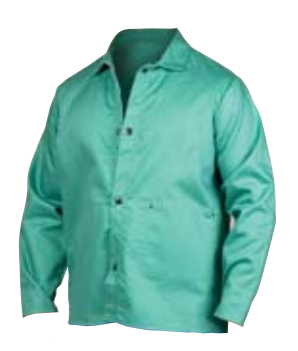
Part No. 940-1

Part No. 940-7: Detachable 14" bib Part No. 940-8: Detachable 20" bib