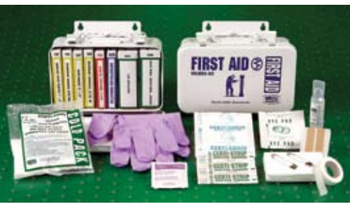
Part No. 3011194