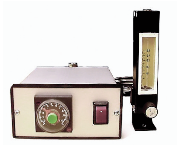
Flowmeter with Timer