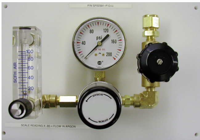
Regulator Flowmeter Panel