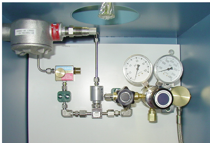
Hydrogen Gas Cabinet with Controls