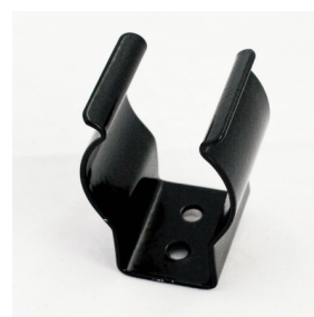
8012C Mounting Clip

Gas traps should be mounted in a vertical position to ensure proper contact of the gas with the adsorbent. Use model 8012C, 8040C or 8050C mounting clip with 8012, 8020 and 8040 Series moisture traps.