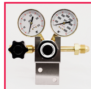
EZ3100 Bracket (see page 91).

Warning: A Purge assembly (see pages 86 and 87) is strongly suggested when using the above regulators with any corrosive gas.