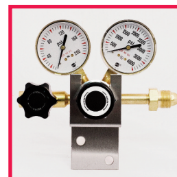
EZ3100 Bracket (see page 91).

Warning: A Purge assembly (see pages 86 and 87) is strongly suggested when using the above regulators with any corrosive gas.