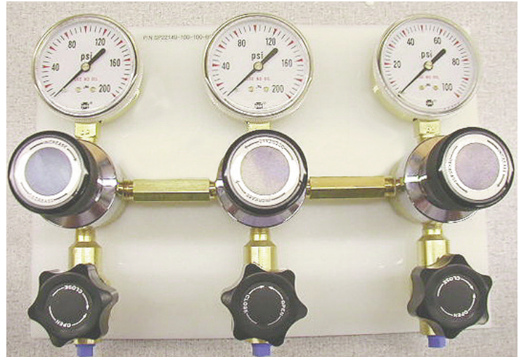
three-regulator panel – inlet may be from the left or the right

2331-H-25-25-50-100-C describes a center inlet brass four-regulator panel in the horizontal orientation, with the first regulator on the left having a 0-25 psig delivery pressure range followed in order by three others: 0-25 psig, 0-50 psig, and 0-100 psig.