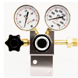
EZ3100 Bracket (see page 101).

Warning: A Purge assembly (see pages 96 and 97) is strongly suggested when using the above regulators with any corrosive gas.